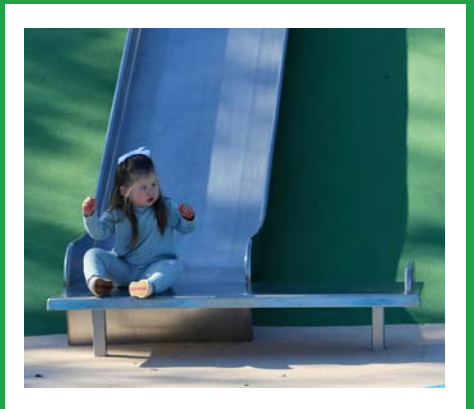
SLIDE AND SIT LANDINGS™ The Magical Bridge-patented bench extensions at the bottom of the slides give those needing extra time a safe space to wait for their mobility device or help from a friend.