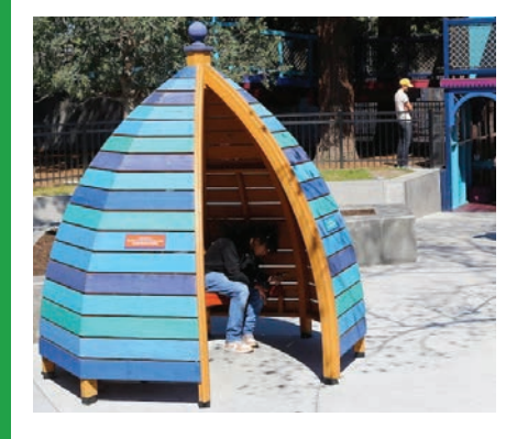
HIDEAWAY HUTS ™ Placed throughout the playground, these custom designed domes with tactile interior walls offer visitors, especially those with autism, a quiet and soothing place to retreat and observe the action.