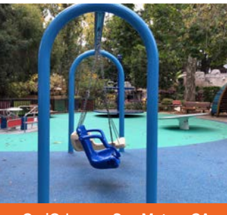
CuriOdyssey, San Mateo, CA