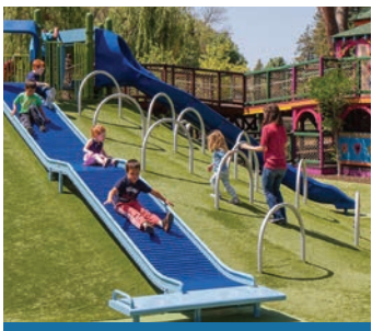
Mitchell Park, Palo Alto, CA

Visit the Magical Bridge Playgrounds currently open to the public, including the first licensed and the first international Magical Bridge Playground located in Hamilton, New Zealand.