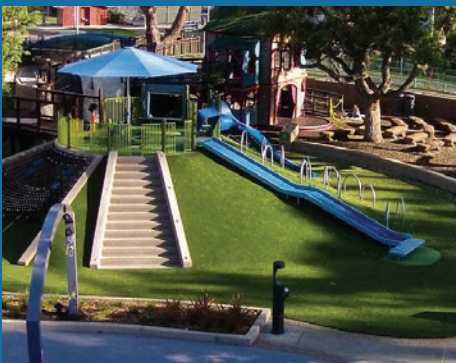
Slide and Climb Mound