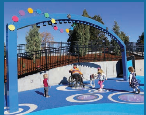
Music Innovation Zone