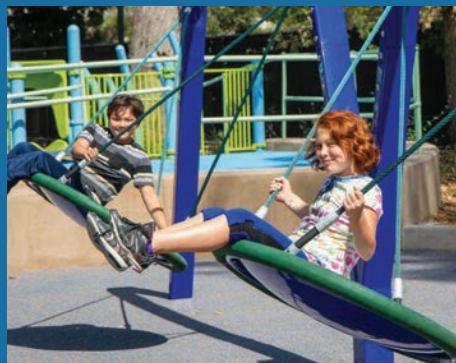
Swing and Sway Zone