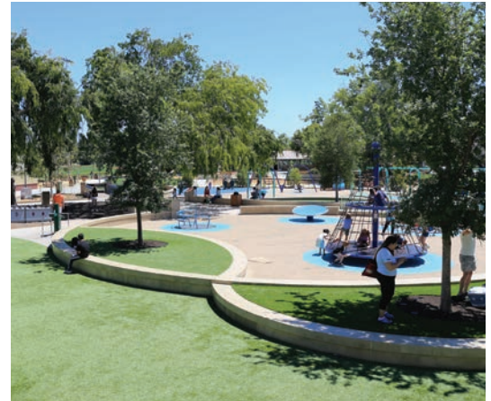
Fair Oaks Park, Sunnyvale, California