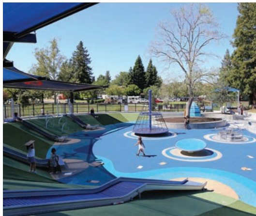
Red Morton Park, Redwood City, California