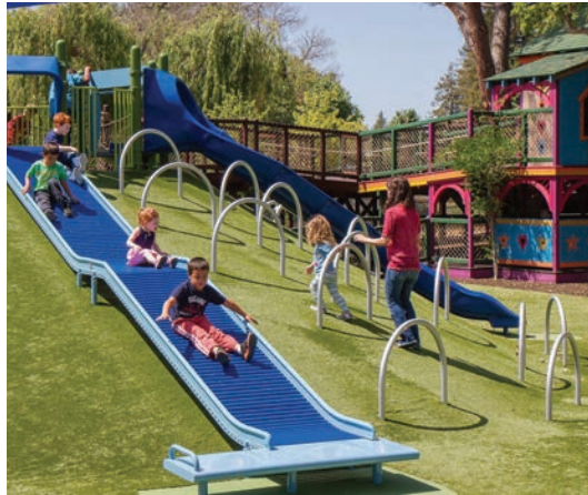
Mitchell Park, Palo Alto, California

Visit a Magical Bridge Playground currently open to the public in the San Francisco Bay Area.