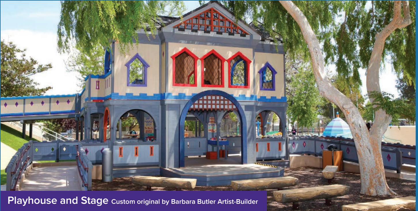
Playhouse and Stage Custom original by Barbara Butler Artist-BUILDER

Carefully identified and customizable Play Zones™ are the foundation of Magical Bridge Playgrounds. Each zone offers a variety of play equipment, multiple challenge levels, and unique benefits for all ages and abilities. Best of all, the spaces and equipment are intentionally designed to provide maximum accessibility so everyone can play together.