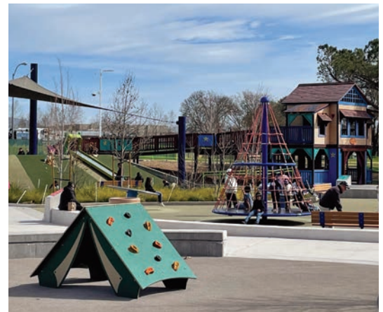
Community Park, Morgan Hill, California